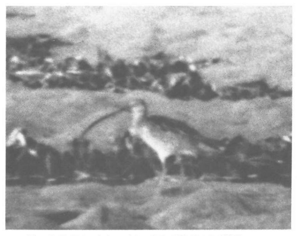
Figure 5. Far Eastern Curlew on Saipan, 9 May 1989.

This species was present on Saipan 4-6 December 1989 and DWS photographed it on 5 December (Fig. 6). This bird was readily identified by its large size, extremely long bill, lack of a crown stripe, indistinct supercilium, white lower back, rump, and wing linings. Other Mariana reports for this species include two sight records for Saipan and a recent one on Guam (Wiles et al., in prep., Engbring & Owen 1981, DFW files).