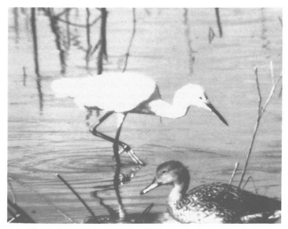
Figure 2. Little Egret on Saipan, 8 Dec. 1989.

On 30 Nov. 1989, JDR and DWS saw a single male in near eclipse plumage on Lake Susupe, Saipan. With the aid of a 35× spotting scope, we noted the rust colored head, somewhat sloped bill and forehead (not as much as A. valisineria ) and slightly peeked crown. The blue bill was dark at its base and tip. The back