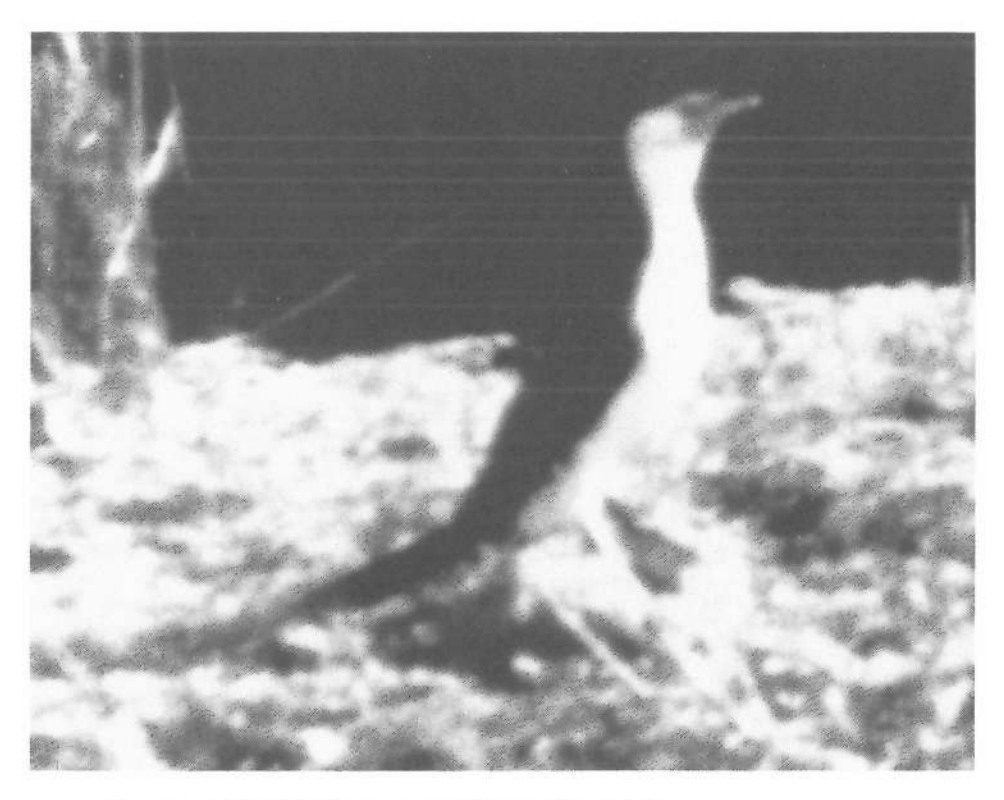
Figure 1. Little Pied Cormorant on Saipan, 6 Dec. 1989.

DWS and JDR made the first sight record of this species on Pagan at Lake Lagona on 26 Apr. 1989. JDR viewed the head and body closely; the bill was black and the lores appeared to blend from black to light gray-green just forward of the eye. It had a more gradually rising forehead and snakelike neck than a Cattle Egret ( Bubulcus ibis ). DWS saw the black legs and yellow feet.