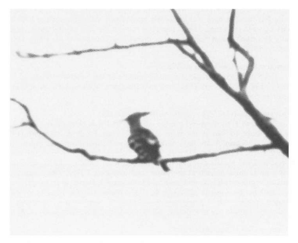
Figure 7. Hoopoe on Saipan, Aug. 1988.

of this African and Eurasian species is in southeast Asia; it has been recorded as a straggler in Japan (Wild Bird Society of Japan 1982).