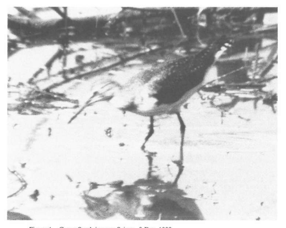
Figure 4. Green Sandpiper on Saipan, 8 Dec. 1989.