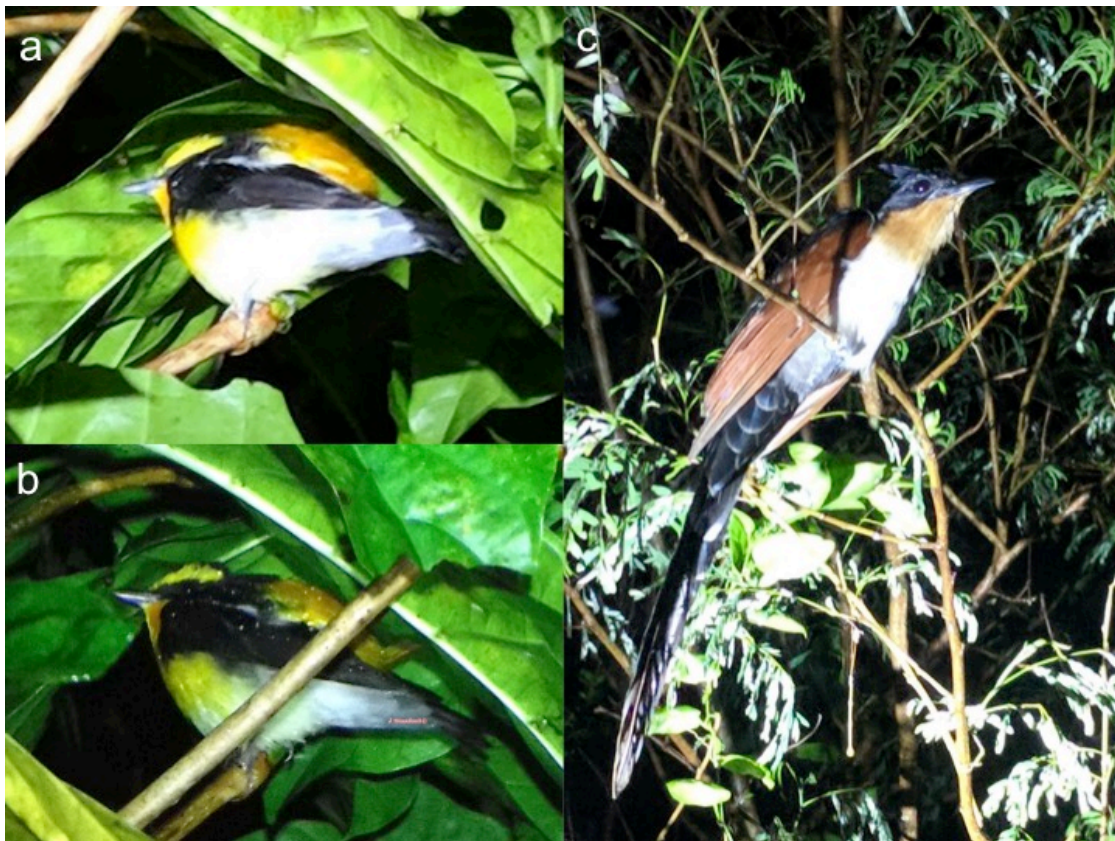
Figure 2. Photographs a) and b) of adult male Narcissus Flycatcher ( Ficedula narcissina ), c) adult Chestnut-winged cuckoo ( Clamator coromandus ) on Guam, Mariana Islands.