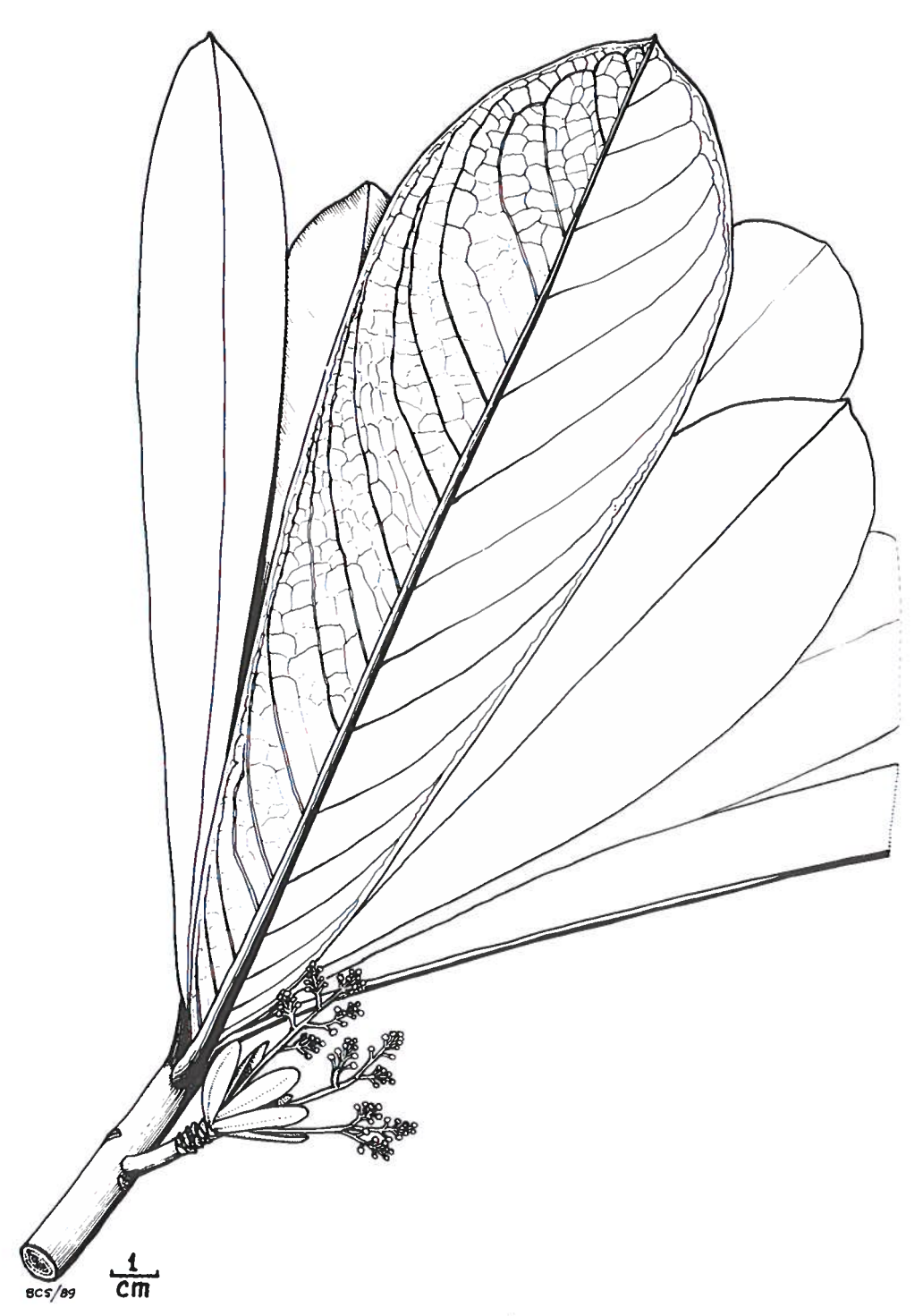
An example of Stone's botanical artwork: Loheria bracteata Merr., from a paper in Micronesica 24(1).