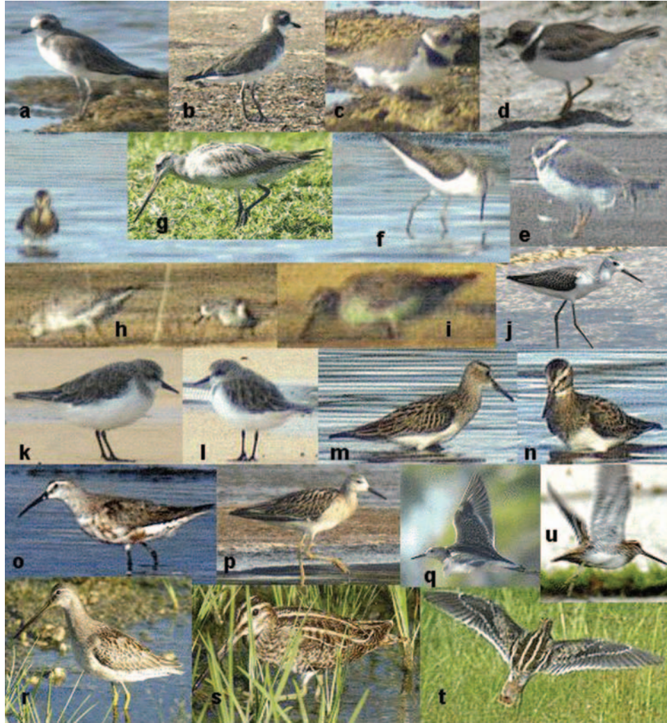
Figure 2. (a, b) Lesser Sand-Plovers on Roi-Namur. (c, d) Common Ringed Plovers on Roi-Namur. (e) Semipalmated Plover on Roi-Namur. (f) Common Greenshank (right) with Pectoral Sandpiper on Roi-Namur. (g) Bar-tailed Godwit on Kwajalein Islet. (h) Red Knot (left) with Sanderling on Kwajalein Islet. (i) Red Knot. (j) Marsh Sandpiper on Roi-Namur. (k, l) Red-necked Stint on Roi-Namur. (m, n) Pectoral Sandpiper on Roi-Namur. (o) Curlew Sandpiper in partial breeding plumage on Roi-Namur. (p, q) Ruff on Roi-Namur. (r) Juvenile Long-billed Dowitcher on Kwajalein Islet. (s, t, u) Common Snipe on Kwajalein Islet.