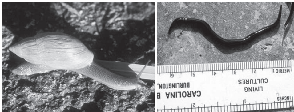
Figure 2. Non-native tree-snail predators known to exist on Pohnpei include the carnivorous snail Euglandina rosea (shell ~ 4 cm long) and the New Guinea flayworm Platydemus manokwari .

The goal of the current study was to determine the current status of the Partula species, the only sizeable arboreal snails, on Pohnpei. To carry out these surveys, we first determined as much as possible from the publications cited above. In addition to Kondo's (1956) brief publication, we extensively utilized the field notes and maps prepared by Kondo and maintained in the Malacology Division of the Bishop Museum. We have also had access to the unpublished survey notes and maps made by Barry Smith of the University of Guam in the 1990s (B. Smith, personal communication). All sites where Partula spp. were reported in these two twentieth century surveys were extensively re-surveyed, and the negative findings are presented here.