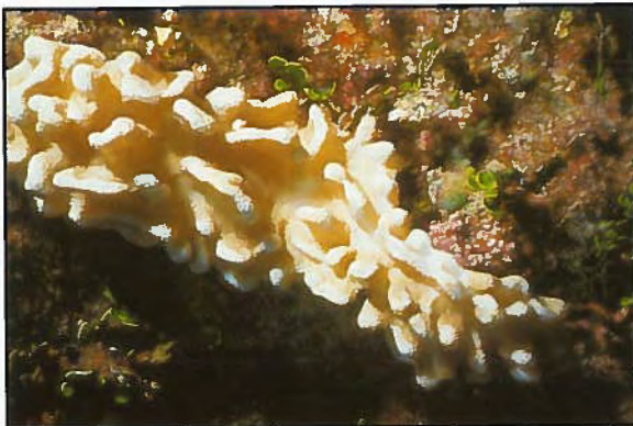
e. Sinularia discrepans Tixier-Durivault, 1970.