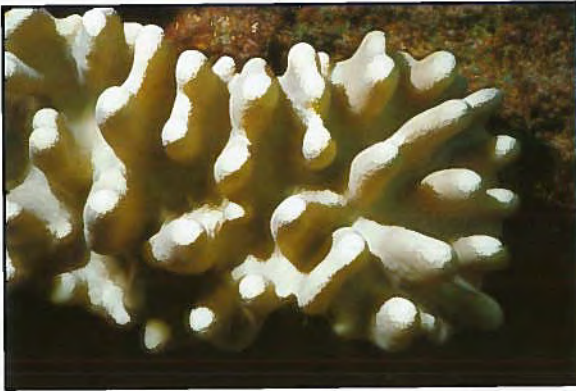
c. Sinularia abrupta Tixier-Durivault, 1970.