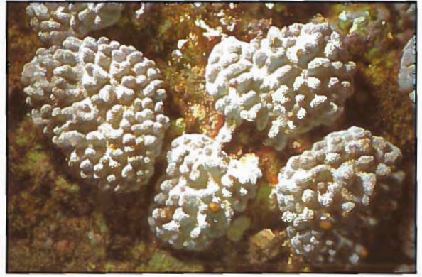
b. Cladiella krempfi (Hickson, 1919) with polyps retracted.