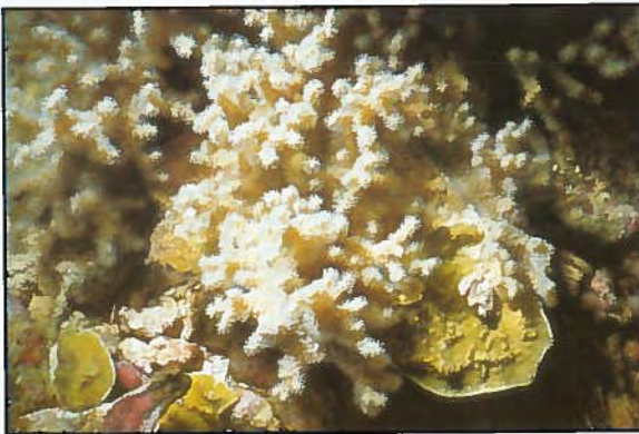
e. Sinularia querciformis (Pratt, 1903).