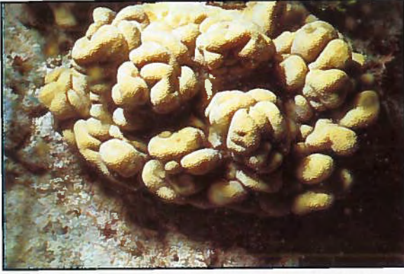
a. Sinularia gibberosa Tixier-Durivault, 1970.