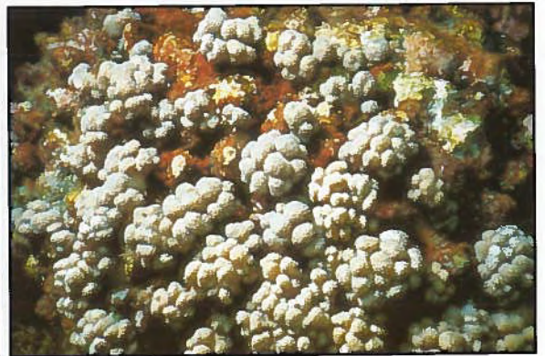
f. Aggregation of Asterospicularia randalli Gawel, 1976.