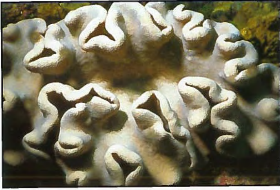
a. Sarcophyton glaucum (Quoy & Gaimard, 1833).