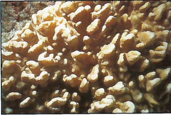
c. Sinularia numerosa Tixier-Durivault, 1970.