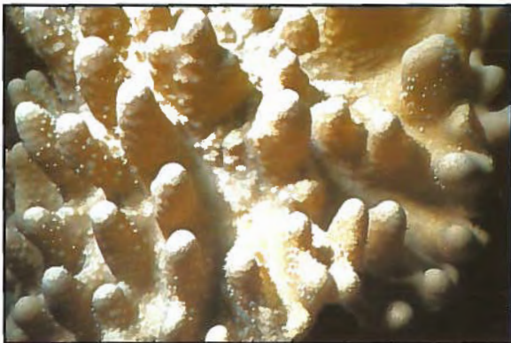
e. Lobophytum pauciflorum (Ehrenberg, 1834).