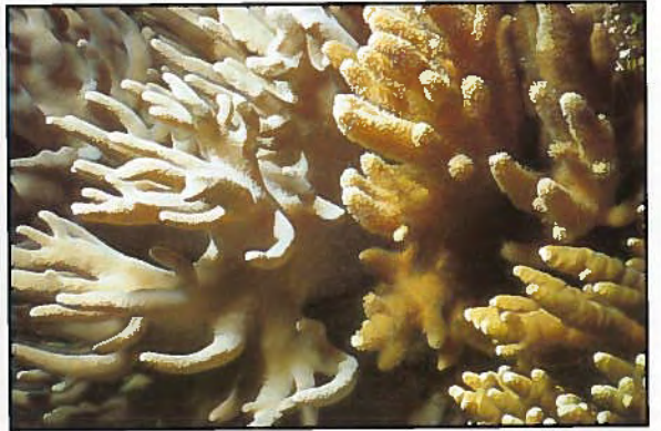
d. Sinularia polydactyla (Ehrenberg, 1834).