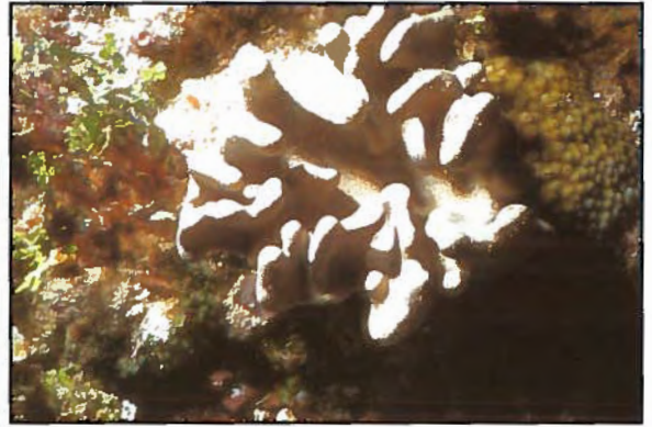
d. Lobophytum batarum Moser, 1919.