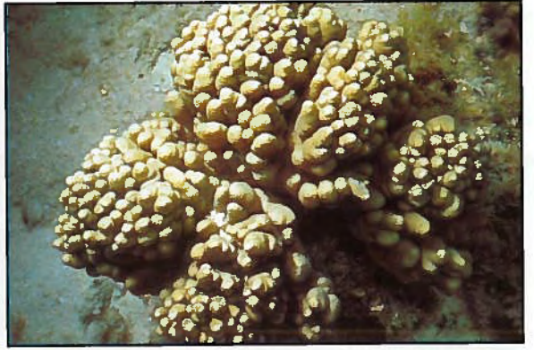
b. Sinularia maxima Verseveldt, 1971.