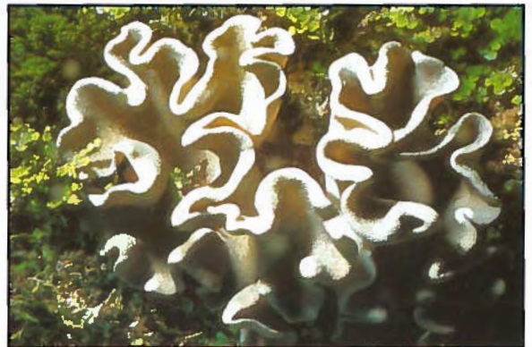
f. Lobophytum sarcophytoides Moser, 1919.