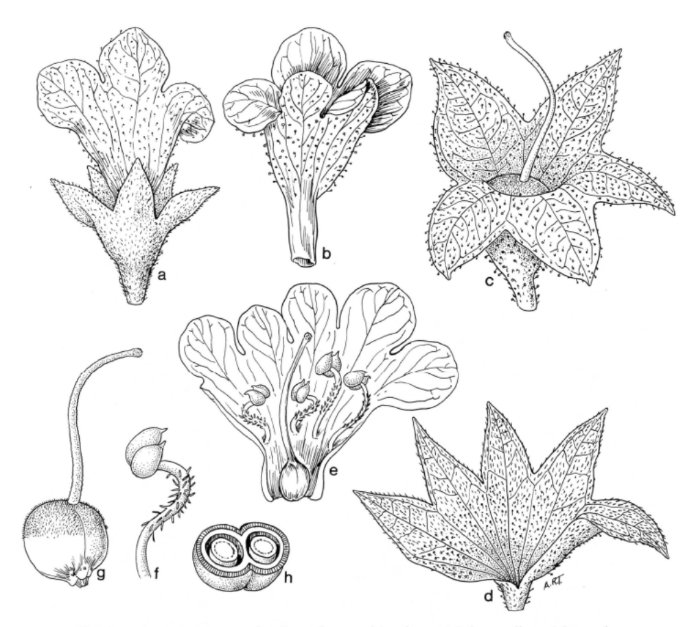
Fig. 2. Nesogenes rotensis details. a, flower with calyx \times 4.5 . b, corolla \times 4.5 . c, calyx with pistil, lower flower \times 6 . d, open calyx, distal flower \times 6 . e, open corolla and enclosed parts \times 4.5 . f, stamen \times 12.5 . g, pistil \times 6 . h, transverse section of fruit \times 6 .

limestone, at 100 m elevation. The collection was made on 23 April 1982 by Herbst and Falanruw 6736 (US, holotype, BISH, GUAM, isotypes). It was growing in association with Scaevola sericea, Terminalia samoensis, Hedyotis strigulosa, Pogonatherum paniceum and Bikkia tetrandra.