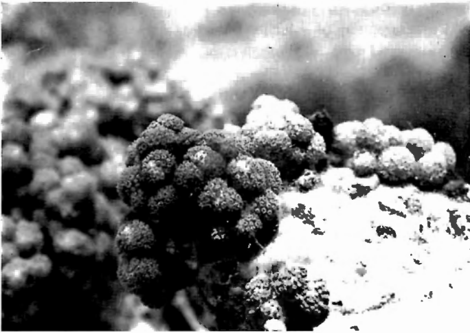
Fig. 2. Asterospicularia randalli colony in situ.