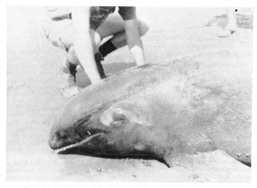
Fig. 1. Head of Peponocephala electra stranded at Inarajan Bay, Guam, Mariana Islands on 6 April 1980.